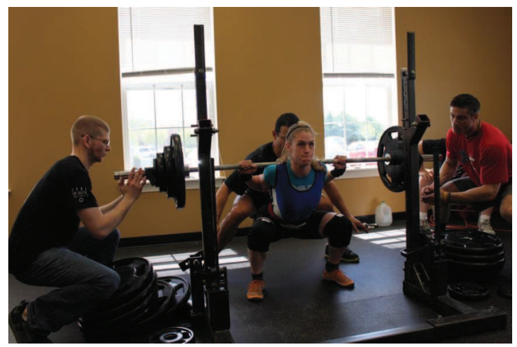
FAITH, FELLOWSHIP, & FOCUS